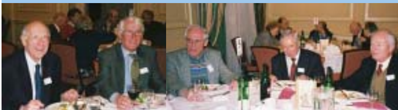
Charing Cross veterans of 1954 to 1957

The Committee is very pleased to announce that the Faculty of Medicine has accepted our offer of funding for an annual CXWMS Alumnus Society Prize in Primary Care Medicine worth £500, to be awarded on the results of the Final MBBS. The first award of this Prize will be in July 2005. The Society's Alumnus Appeal Fund remains open if any former students of the three Schools wish to contribute to it. Information is available from the Honorary Secretary.